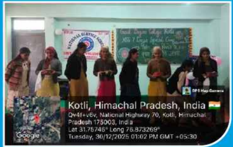
Kotli, Himachal Pradesh, India

Qv4f+v6v, National Highway 70, Kotli, Himachal Pradesh 175003, India Lat 31.75746° Long 76.873269° Tuesday, 30/12/2025 01:02 PM GMT +05:30