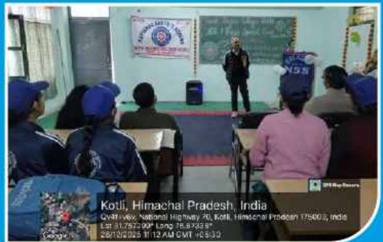
Kotli, Himachal Pradesh, India

Qv4f+v6v, National Highway 70, Kotli, Himachal Pradesh 175003, India Lat 31.757290° Long 76.873387° 28/12/2025 11:12 AM GMT +05:30