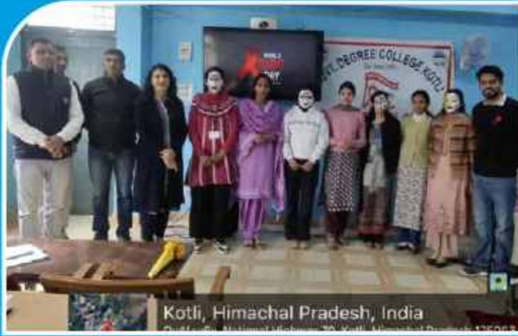
Kotli, Himachal Pradesh, India